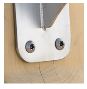
Stainless steel screws and/or screws covered with plastic caps,