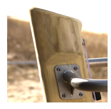
Construction made of Robinia - very durable acacia wood with a diameter of ~ 18 cm without sharp edges, resistant to weather conditions,