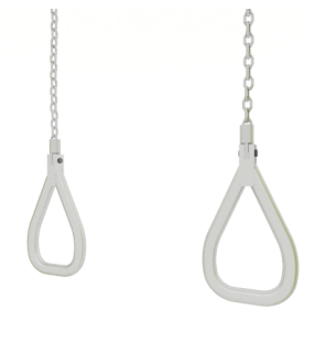
Certified handles and calibrated chains made of stainless steel, preventing fingers from getting caught,