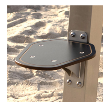
Seats/backrests made of durable HPL plate, resistant to weather conditions,