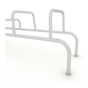
Stainless steel bars with a diameter of 38 mm for a comfortable grip during exercises.