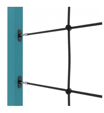
Steel ropes in polypropylene braid, connected with durable plastic elements, Steel rope in polypropylene braid, stainless steel or aluminum,