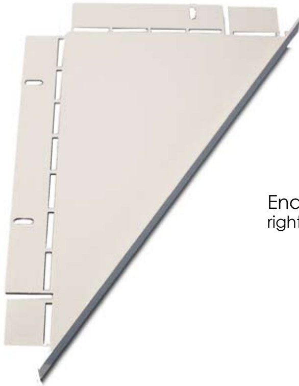
End sections (image show right side)

One AKUCORNER element consist of following components: