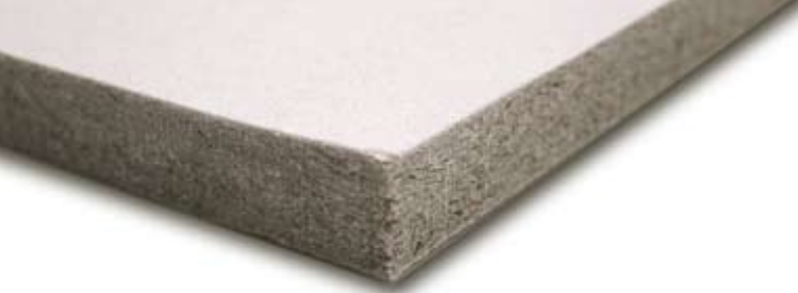
Acoustic panel 15 mm